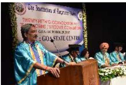
Convocation address by Chief Guest