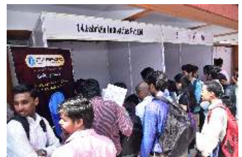
Participants visiting the stalls