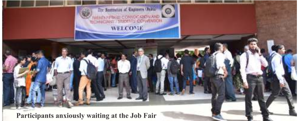
Participants anxiously waiting at the Job Fair

The Institution of Engineers (India), Goa State Centre has organised the Twenty-Fifth IEI Convocation and Technicians' / Students' Convention at Kala Academy Panaji - Goa on October 28-29, 2017. The major attractions of the program were the Job Fair, Technicians'/ Students' Convention, AITC/AISC meetings and Convocation Ceremony.