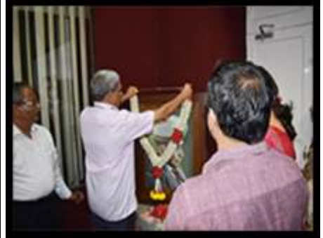
Hon'ble Chief Guest Shri Manohar Parrikar, Garlanding the Portrait of Sir Mokshagundam Visvesvaraya