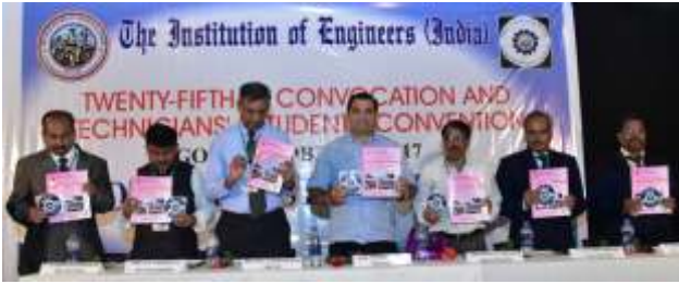
Dignitaries releasing the Souvenir