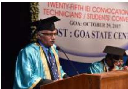
President IEI presenting the Convocation address