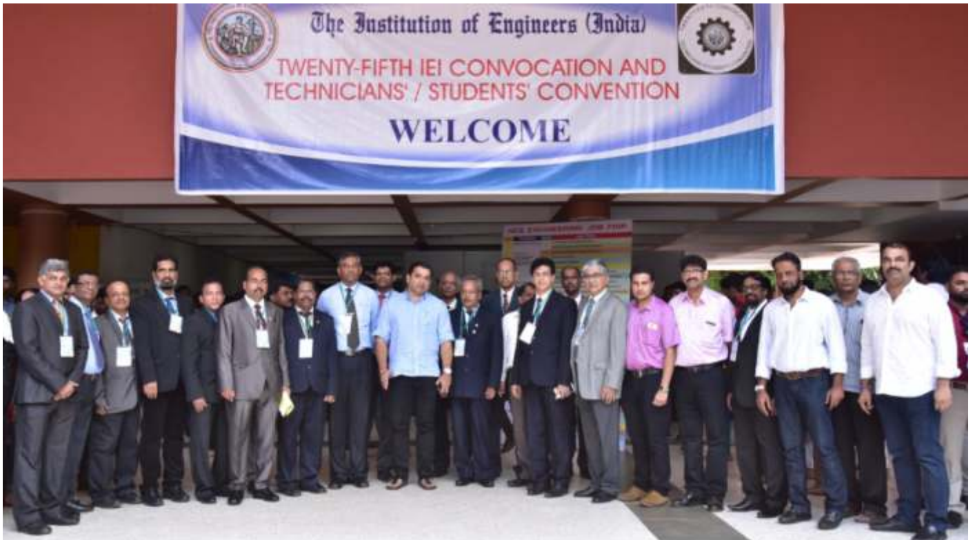
Organising Committee along with Shri Rohan Khaunte, Hon'ble Minister for Labour and Employment & IT