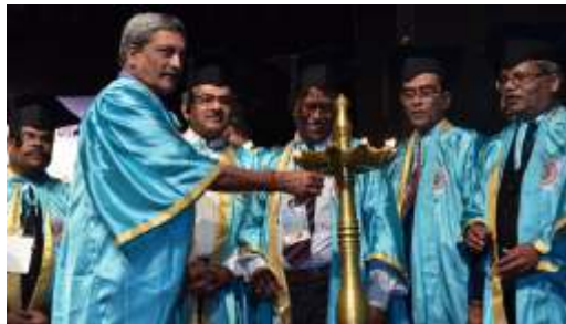
Hon'ble Chief Guest lighting the traditional lamp along with other dignitaries