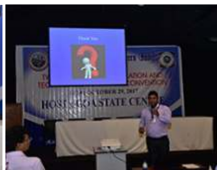
The presentation of the paper by the participants