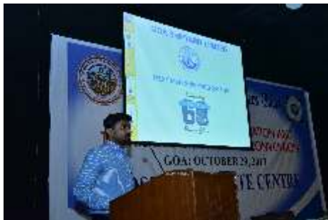
Presentation by the representative of Goa Shipyard Limited