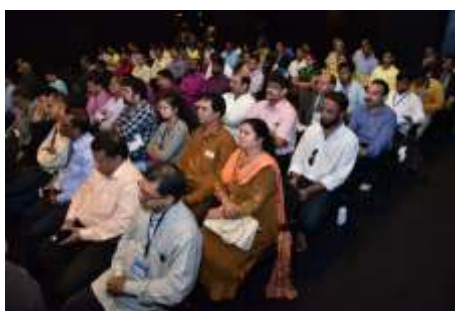
Audience at the Inauguration Programme