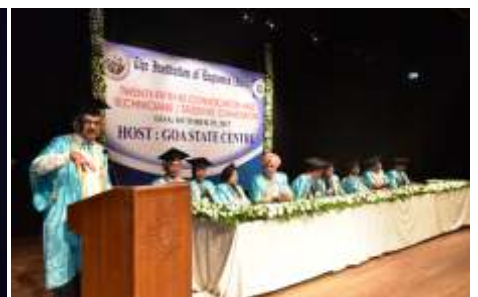
Keynote address by Guest of Honour