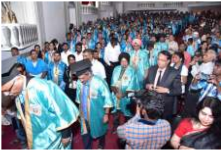
Convocation Procession marches towards the dais